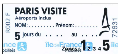
PARIS VISITE 5 DAYS, 5 ZONES

Rates on Parisjetaime.com on 1 December 2023.